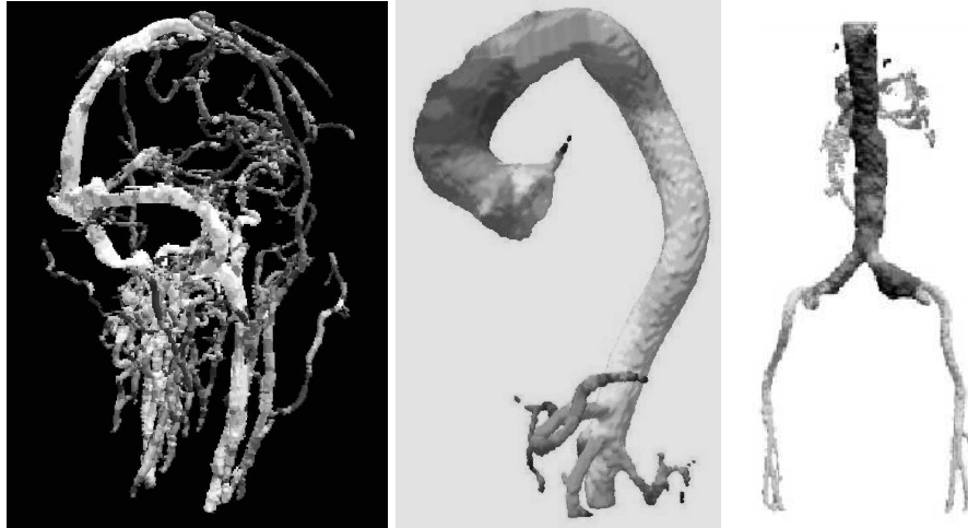
Fig. 2. Vessel quantification of angiographic data. From left to right: cerebral veins and arteries, arch of aorta, iliac bifurcation.