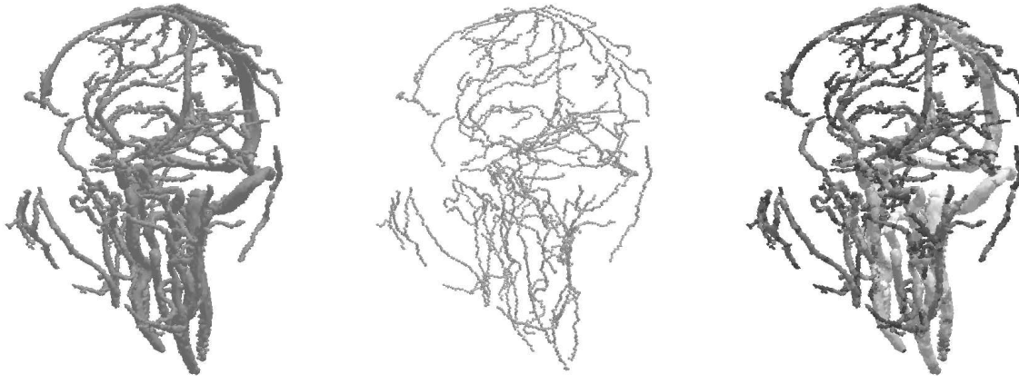
Figure 2. 3D visualization of the computed parameters for an image p^i of the database P . From left to right: segmented vessels ( p^i_{seg} ), skeleton ( p^i_{ske} ), vessel diameter ( p^i_{thi} ).

consider that for a given set P , all p \in P have the same dimensions d_x, d_y, d_z . The set [0, d_x - 1] \times [0, d_y - 1] \times [0, d_z - 1] will be denoted by I while an element (x, y, z) \in I will be denoted by \mathbf{x} from now on.