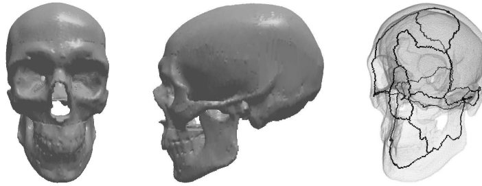
Fig. 2. Skull template used in the proposed application. Left, middle: whole template. Right: template visualised with its topological skeleton. It has to be noticed that this is a partial template: structures such as the vertebrae, for example, are not modelled since their segmentation is not required here.

followed by a thresholding with a threshold of 0.5 ( M_2 ). These methods are compared from two points of view, a topological one and a geometrical one.