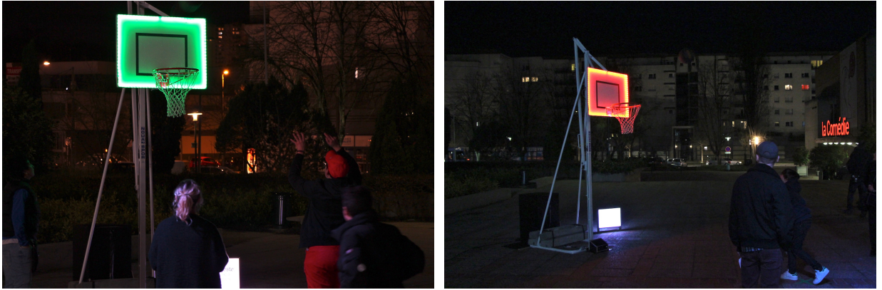
Fig. 4. (a) Good gesture (b) Bad gesture.

The score s_2 \in [0, 1] representing spine vertical alignment is deduced as follows from the angle \beta calculated by the dot product of \mathbf{s} with \mathbf{v} .