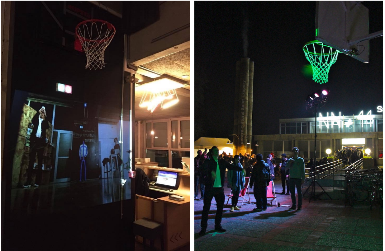
Fig. 1. (a) Indoor version with video projector and speakers (b) Outdoor version with LEDs.

At the crossing of art, computing and sport, this project aims to create an augmented basketball basket by embedding sensors, actuators and computers. This device has been created for the Kinestezi digital art exhibition run by Saint-Ex that questions the notion of body, its movements and its role in the creation process: it acts as a trigger that reveals the nature of an artwork. In some ways, it can be seen as an interactive artistic installation that visually demonstrates inner perceptions like balance and stance. Within a sporting perspective, LeBonGeste can be also considered as a training device for basketball beginner players. By hijacking gaming peripherals like a Kinect sensor, it provides technical advices by entertaining and challenging the player.