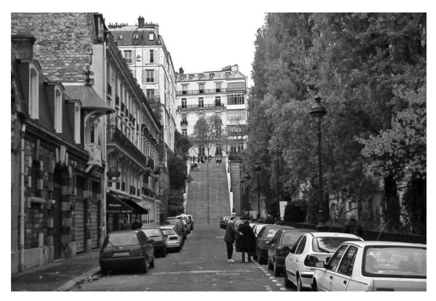
Figure 10.3: Ecological "community gardens" ( jardins partagés ) in the wealthy area of Trocadero-16 ème arrondissement of Paris. 2012

could manage commons more efficiently than the market or institutional structures (Ostrom 1998). In this vein, the Paris City Council encourages residents, associations, and local storekeepers to get involved as local actors in the governance of their quartier. They organize many so-called "sustainable" events: thematic markets, Repas de Voisins (Neighbors' Meals), carnivals, and so forth.