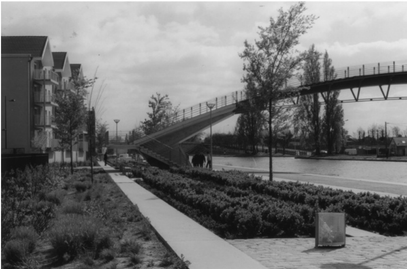
Figure 10.2 : The Canal Saint-Denis area before and after regeneration.