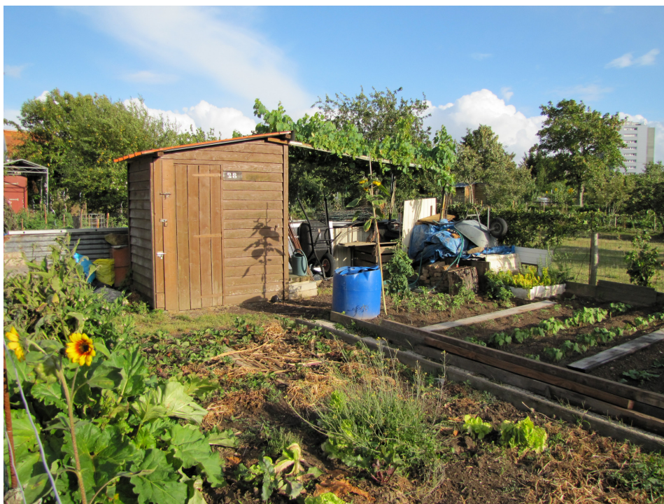
Figure 3. A Shack and a Garden at La Fournillière.

Urban agriculture lends particularly well to long-lasting urban policies, especially those turning environmental “bads”—such as brownfields and wastelands—into environmental goods and urban amenities. Naturally, it will not be possible everywhere. There are also health issues when redeveloping brownfields for urban agriculture, due to potentially polluted groundwater and soils. Nonetheless, it would make sense to establish productive lands as a key component of urban design when possible, as proposed by Andre Viljoen and Joe Howe [87]. A network of agricultural plots, which would penetrate the smallest nooks and crannies of the urban fabric, should be a wonderful tool to link the different components of the city, while providing other ecosystem services such as walking and leisure activities. Besides, such a network would greatly improve urban resilience, by linking formerly scattered vegetated places within a consistent system. Squares, parks, gardens—community gardens and kitchen gardens, as well as public gardens—and more generally all vegetated urban public spaces will be connected by urban agriculture.