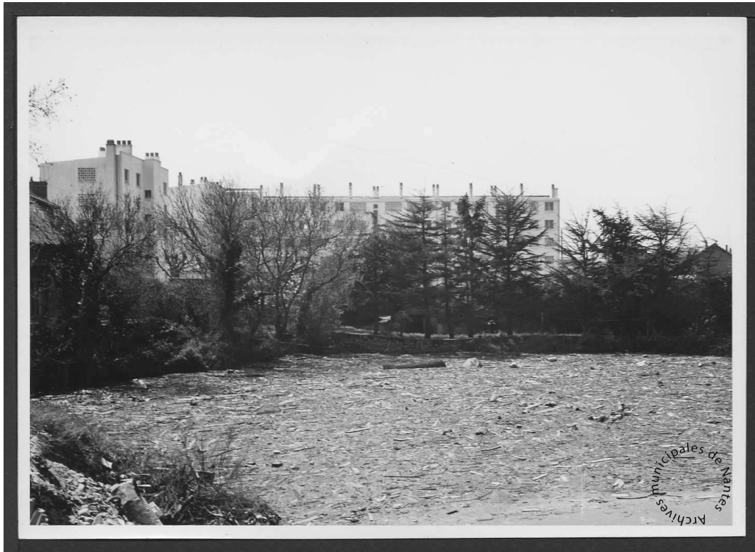
Figure 2. La Fournillière in the early seventies.

On the other side was a completely different category. These gardeners came from the disadvantaged social housing complexes around La Fournillière. They had different origins and ethnic background, being mainly North Africans. Many among them were unemployed and lived on social benefits. For them, "owning" a piece of land at La Fournillière was a way of keeping active, and it was a place where they could settle symbolically—a "circulatory space" ( territoire circulatoire ), within the meaning of Alain Tarrus—, a place where they could grow roots, literally [82]. These gardeners were called " les autres " (the others) by the local gardeners from the first category, but they represented an overwhelming majority with nearly 4 gardeners out of 5.