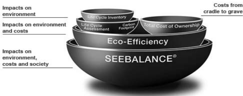
Figure 3 – Eco-efficiency, eco-design methods by BASF (BASF, 2010)

Despite these failings, there is a market for ecodesign methods proposed by the biggest petrochemical firms – such as BASF that proposes to sell ecodesign methods for its own sector. They are directly inspired by ISO 14040 standards (Saling et al. , 2002, p. 3). However, even if chemical products are selected with improvement of eco-efficiency in mind and are characterized by substitution of raw materials, we argue that standards are the main objective for new competitive advantages. It means that, if environmental innovations are made with eco-design standards, then the market is essential to spread them, because there is a market for eco-design standards. That is why we will argue that this kind of environmental innovation applied to eco-design methods cannot point to a balance between the technosphere and the biosphere.