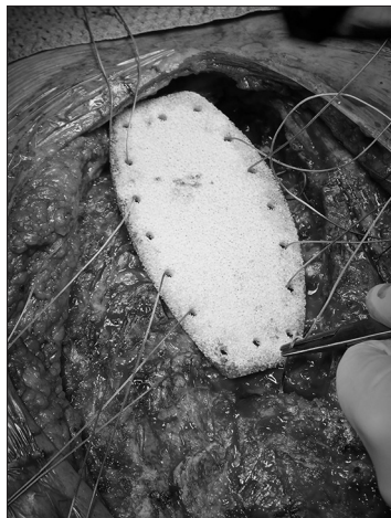
Figure 1: Anchored prosthesis with sutures

We propose a new material for thoracic wall reconstruction and particularly for sternum. Several drawbacks have been reported for biomaterials used in chest wall reconstruction over the past 30 years: [2] erosion of adjacent structures, rupture and migration, infection, or immunological reaction. During the past 5 years, custom-made titanium sternal implants, sternal allografts, and mesh have been associated with advantages over other materials. Nonetheless, all requirements of the ideal sternal replacement