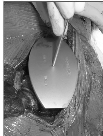
Figure 2: Testing metallic implant