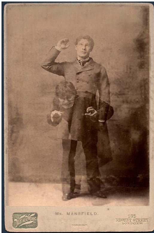
Fig. 1: Richard Mansfield as Dr Jekyll and Mr Hyde (1887) 5

The status of the image is quite problematic if not fully aporetic as it re-unites the two separate halves of Stevenson's character. 5 Still, this photograph highlights the challenging issue of illustrating conflicting plot lines: as it gives a body to the secret personality of a man, it also won't make this initially invisible nature plainly visible. As Roger Bozetto explains "the portrait of the monster is impossible" (141-151). This obstacle can fully be felt in the illustrated editions of The Strange Case , mainly decorating the text with portraits of the various characters while failing to offer satisfactory narrative images.