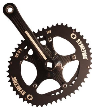
Figure 1: The O-Symmetric ring

Statistical analysis: Data are presented as mean \pm SD. Wilcoxon signed non parametric tests were used to examine difference in PO, CAD and muscular activation between circular and O-Symmetric (OSY) rings. All criteria of significance were chosen at p < 0.05 .