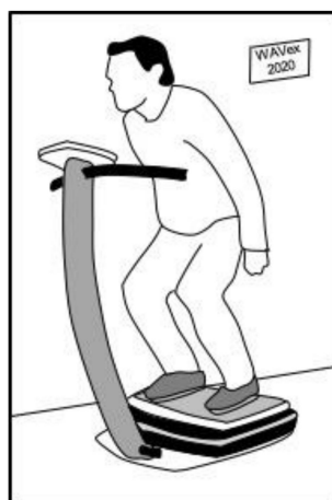
Figure 1. Conventional squat exercise on a WBV platform [54].

particularly unstable. Furthermore, the approach also relieves the necessity of close contacts with the patient, thus potentially reducing the spread of infectious diseases.