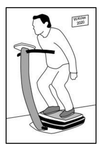
Figure 1. Conventional squat exercise on a WBV platform [54].

particularly unstable. Furthermore, the approach also relieves the necessity of close contacts with the patient, thus potentially reducing the spread of infectious diseases.