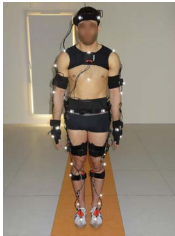
Fig. 1. Quiet stance of a Subject wearing MVN Biomech system and reflective markers of Vicon system.

The experiment took place inside the laboratory of Superior School of Osteopathy Paris. Twenty healthy subjects (10 male and 10 female) voluntarily participated to this study. All subjects were asked to perform three quiet stances in natural position, arms along his body, looking forward, during thirty seconds followed by a vertical jump. Kinematic data were collected simultaneously with a MVN Biomech system and Vicon systems (fig. 1). At all, sixty upright postures were studied.