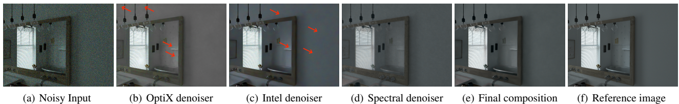
Figure 1: Left to right : (a) Noisy 1024 SPP input generated using the Omen spectral engine [Uni22]; (b) NVIDIA's OptiX denoiser [NVi17]; (c) Intel's Open Image Denoise [Int21]; (d) Our spectral denoiser; (e) Final composition; (f) Reference generated by Omen with 262,144 SPP.