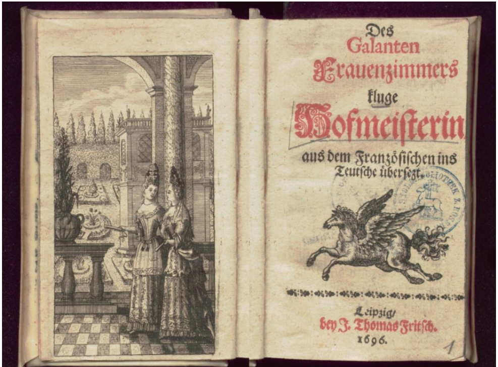
fig. 2 Leipzig 1696 – Leipzig 1711: Des Galanten Frauenzimmers kluge Hofmeisterin

sees the act of reading and reading matter as indispensable means of education is strikingly placed in the German title: “ Vorbericht an den Leser (Preface to the reader)”.