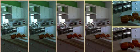
Figure 1: Visual comparison of different denoisers on Kitchen scene. From left to right: Noisy, OptiX, ours ( \lambda +PCA+DS), Ground truth, and crops: OptiX (top), ours (bottom).